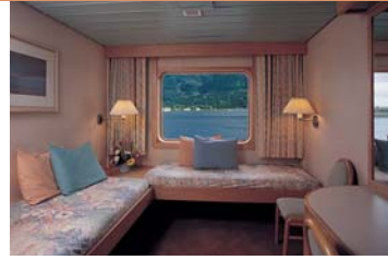
Categories 4 & 5

For detailed information about our Yorktown Clipper, please visit us on the Web at www.clippercruise.com/yorktown