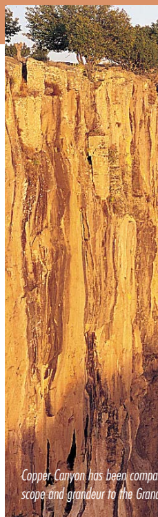
Copper Canyon has been compared in scope and grandeur to the Grand

Isla San Francisco. Like most of the other islands in the Sea of Cortez, Isla San Francisco is uninhabited and represents an irresistible natural laboratory. In addition to spotting birds such as yellow-footed gulls, sandpipers, and white-throated swifts that nest along holes in the cliffs, you may also see the fascinating cacti that thrive in this volcanic-rock and salt-flat environment. Snorkelers will want to keep a lookout for beautiful Cortez angelfish, which are endemic to the Sea of Cortez.