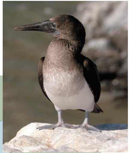
Boobies abound in the Sea of Cortez.

DAY 3 Isla Coronado/Loreto Discovered by Francisco Ortega during a pearling expedition in 1633, Isla Coronado looks like one island, but is in fact a small volcanic island and a detached, low rocky islet. You'll have all morning to enjoy the unblemished beaches, shimmering sea, warm breezes, and an overhead sky so vivid it takes your breath away. Swim and snorkel in water so clear you can see the bottom a hundred feet below, or view the captivating rock formations created from long-ago volcanic eruptions.