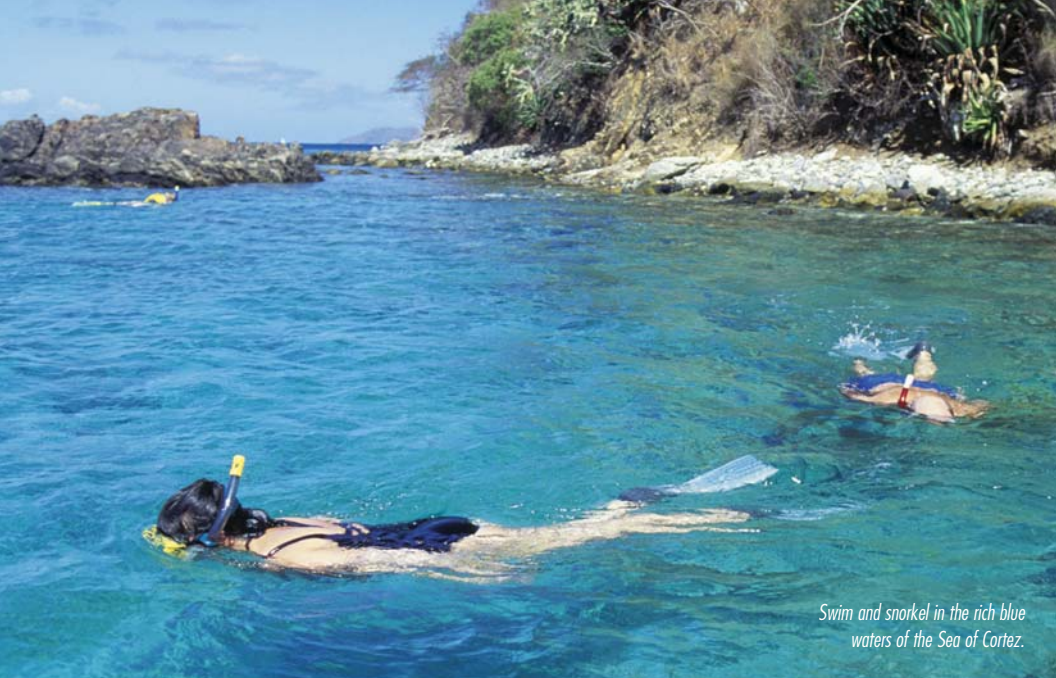
Swim and snorkel in the rich blue waters of the Sea of Cortez.