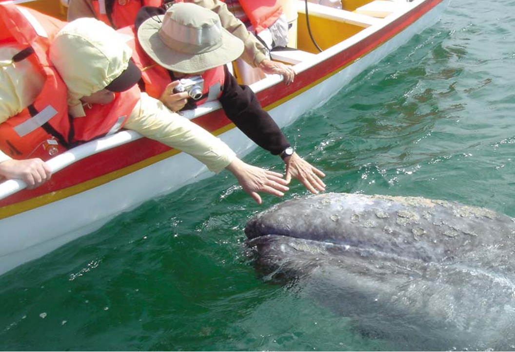
Close encounters with the gray whales of Bahía Magdalena are common.

Early this afternoon, sail for Loreto, an unassuming, authentic Mexican village. The first European settlement in the Californias, Loreto was founded in 1697 by Jesuit priest and explorer Juan María Salvatierra with the establishment of La Misión de Nuestra Señora de Loreto. The town served as the Californias' secular and religious capital for 132 years.