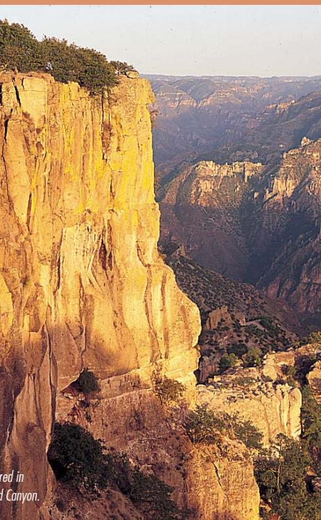
red in d Canyon.